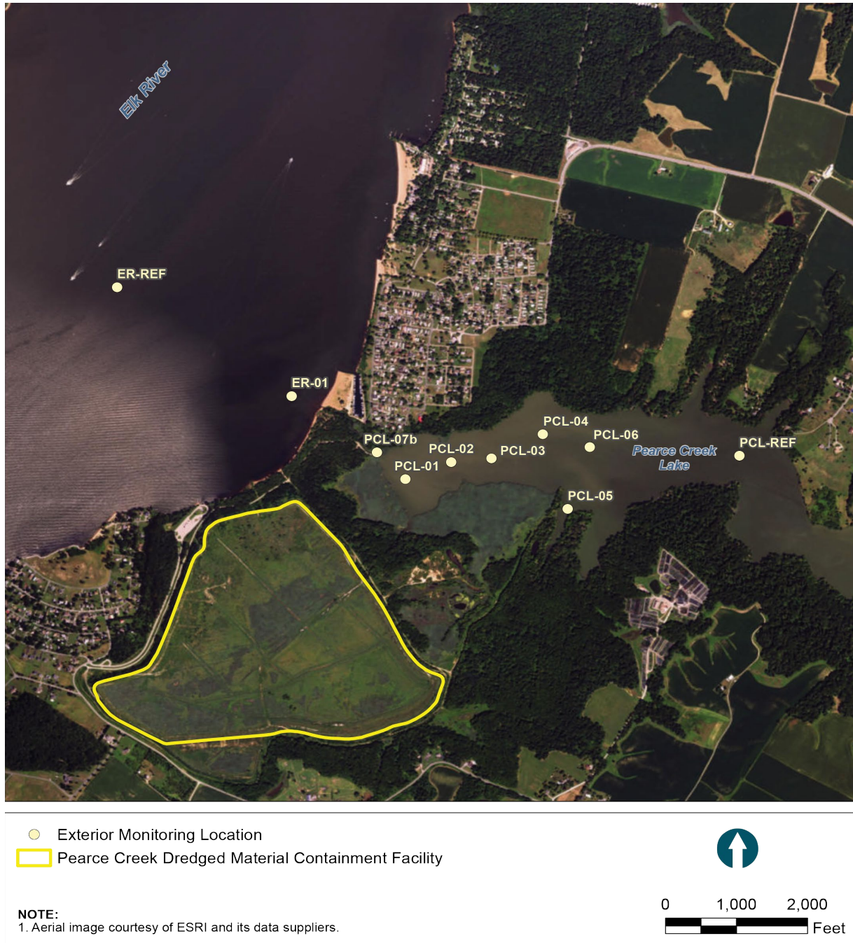
FIGURE 1. EXTERIOR MONITORING LOCATIONS

This monitoring event is the initial post-placement monitoring event since dredged material placement began in late 2017 at the Pearce Creek DMCF. The frequency of exterior monitoring events beyond those planned through the fall of 2018 will be determined through the adaptive management process.